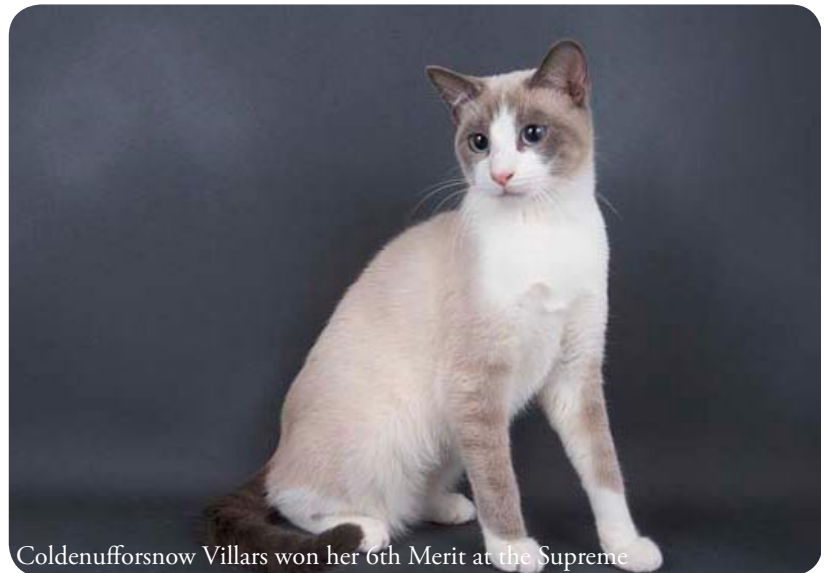
Coldenufforsnow Villars won her 6th Merit at the Supreme

remains for me to wish you all a happy and successful New Year.