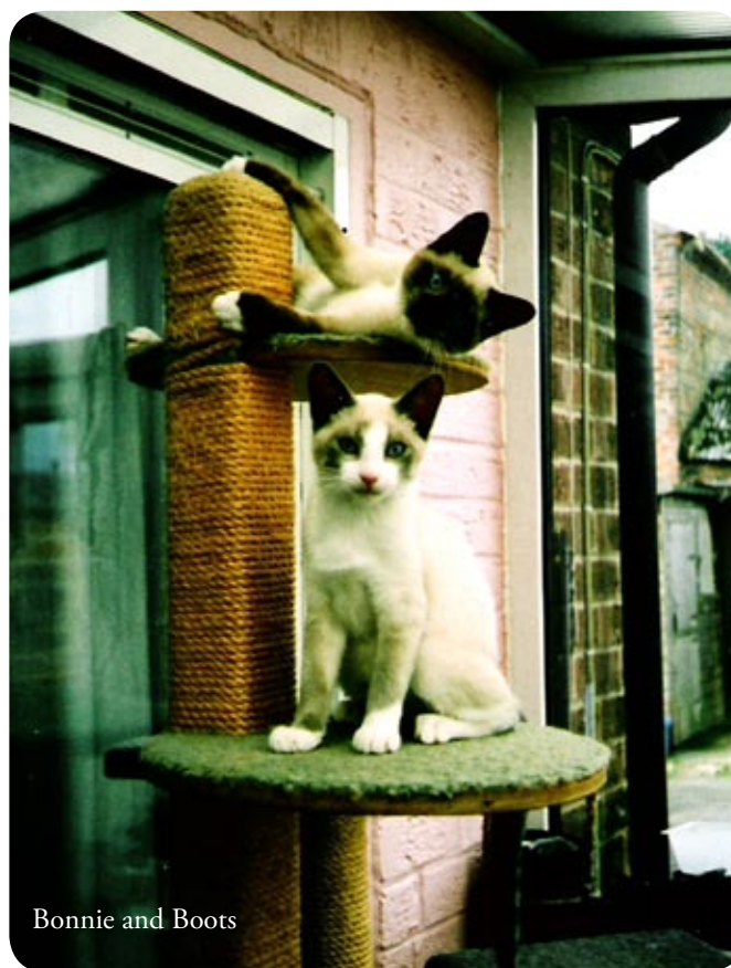
Bonnie and Boots

Boots - lugs my 'boots' down the stairs by the laces. Bonnie - pushes toys downstairs, takes them back up the stairs in her mouth, then does it all over again numerous times - in the middle of the night.